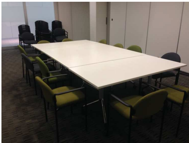
Seminar room 1 "board room style"

Capacity of single room in 'board room style': approx 15-20 people. Capacity of single room in 'seminar style' approx 35 people. Capacity of combined rooms 'seminar style' up to 80 people. Capacity of combined rooms 'cabaret style' (or 'workshop style') up to 50 people. Smaller meeting rooms are also available in other areas which are suitable for groups of 2-10 people. Please contact the BHI Facility Manager (ph 82227 7427) for more information.