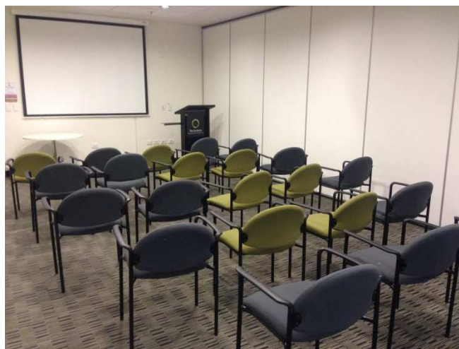
Seminar room 2 'seminar style'