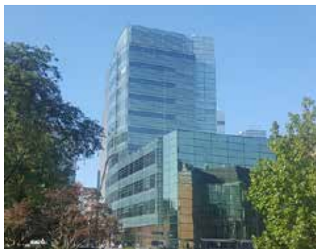
Centre for Life Sciences, Harvard Medical School, Boston, USA