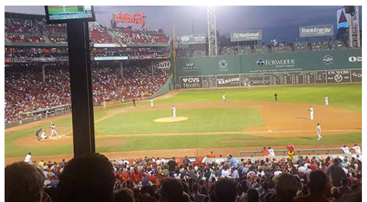
The Boston Red Sox